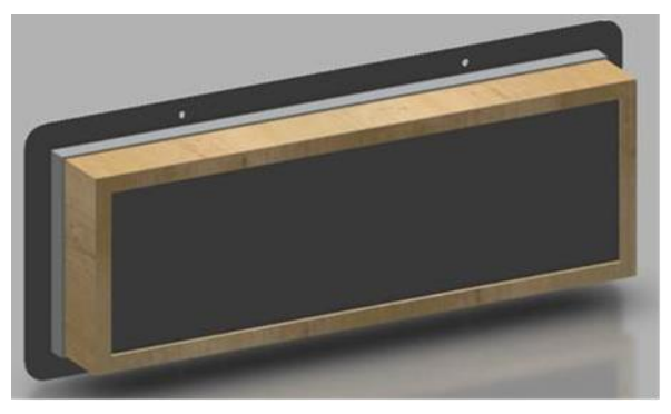
Fig.1 FB Eaves Vent seen from above.

FB Eaves Vent shall be installed according to installation details shown in "Standard Construction Details for the product, belonging to documentation RISEFR 030-0310". Eaves Vent must be installed in horizontal position.