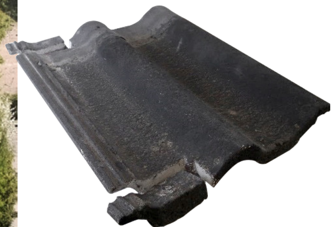
Roofing tiles by Renotech Geopolymer solution 30+ years