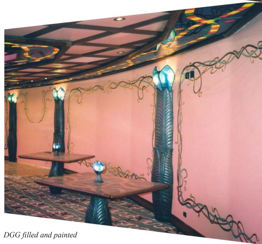
DGG filled and painted