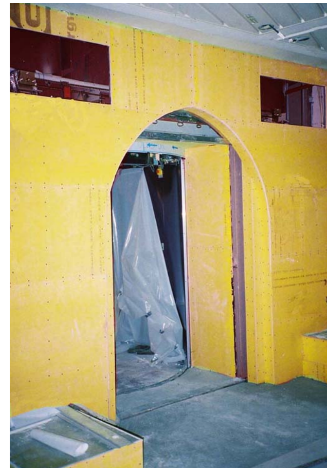
Substrate for various surfaces