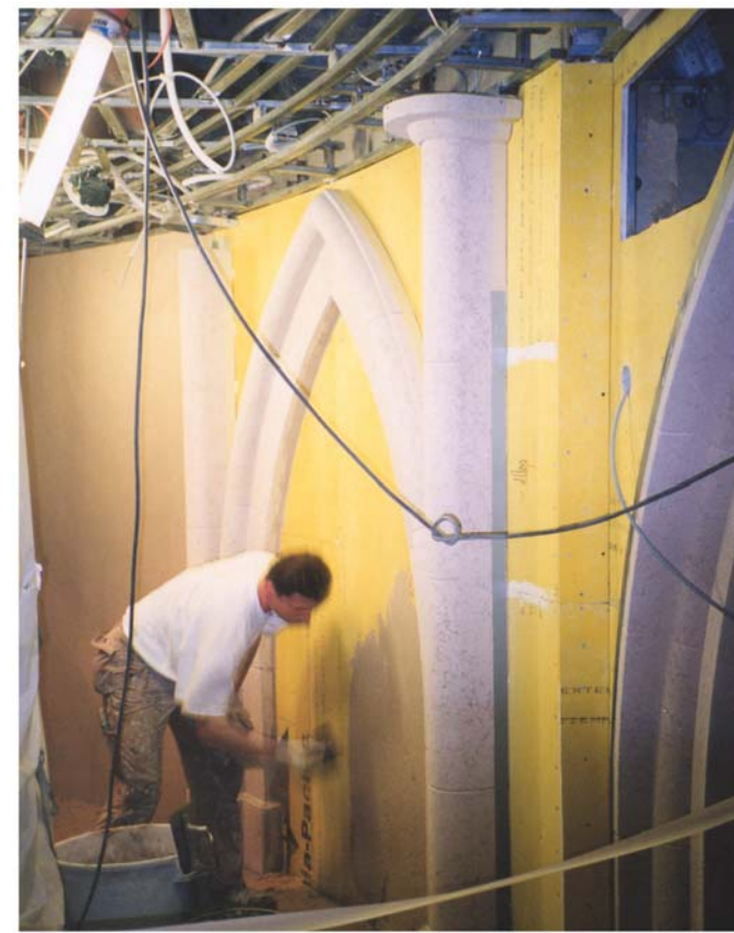
As substrate for Renotech Stonemix 54 trowel applied surface