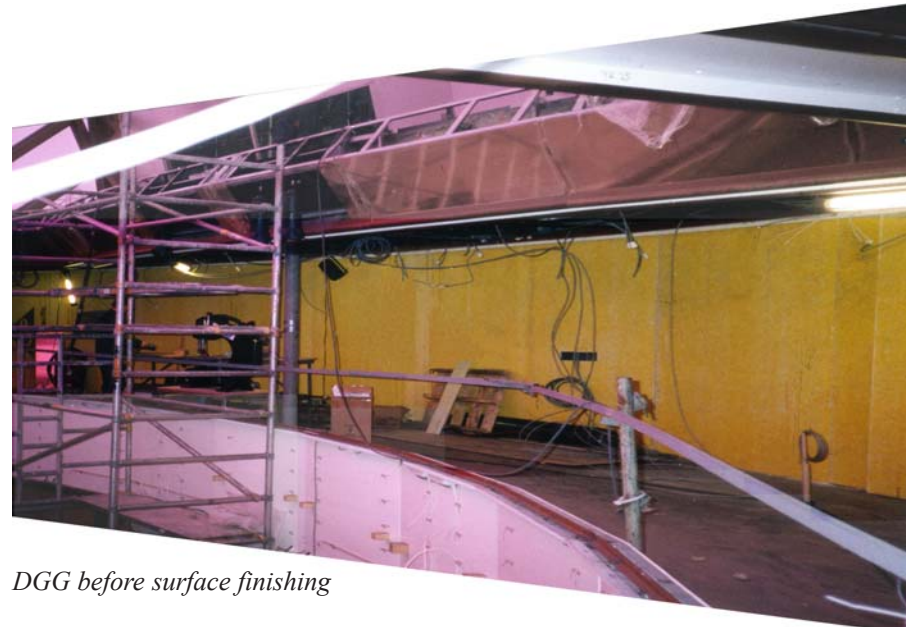
DGG before surface finishing

Panels should not be installed using only staples or adhesives. Maximum stud spacing for 1/2" (12.7 mm) Dens-Glass Gold gypsum sheathing is 16" (406 mm) o.c. and 24' (610 mm) o.c. for 5/8" (15.9 mm) Dens-Glass Gold (Fireguard Type X).